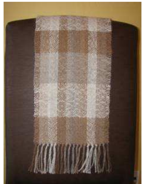
Harmony Scarf #1

Submitted by Pamela Tait ILR-SD Fleece Committee