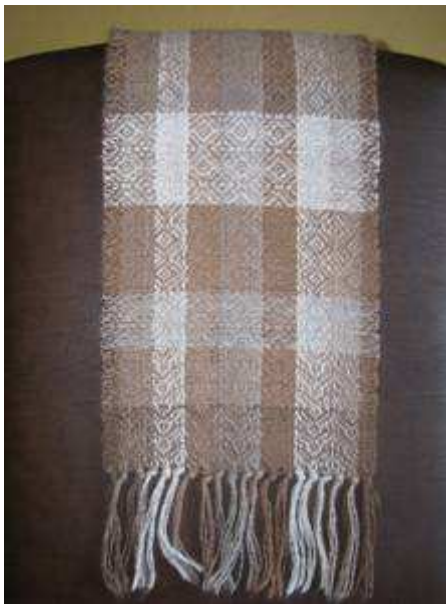
Harmony Scarf #2

After taking the pieces off of the loom, I tied simple knots for the fringe, then cut it to my desired length. I hand washed both pieces. When they were dry, I re-measured the lengths and found that I had very little shrinkage with this llama yarn. My woven 69" scarf ended up 67" finished, instead of the 60" I had figured. I learned that llama does not have the same shrinkage as other yarns such as cotton.